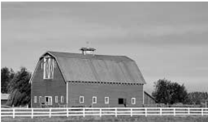
Remote Sensing from page 6

The project was sponsored in part by the Colorado State University Agricultural Experiment Station + Cooperative Extension + IPM, Colorado Dry Bean Administrative Committee, Nebraska Dry Bean Commission, Griffin, ISK Biosciences, and Novartis.